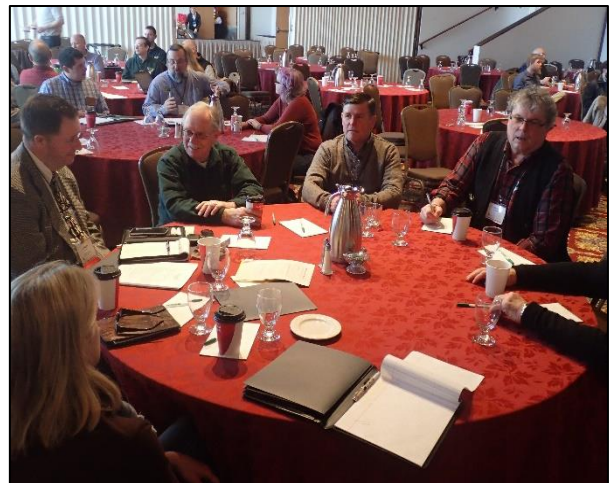
The SAF New Jersey Division discusses business Friday morning.