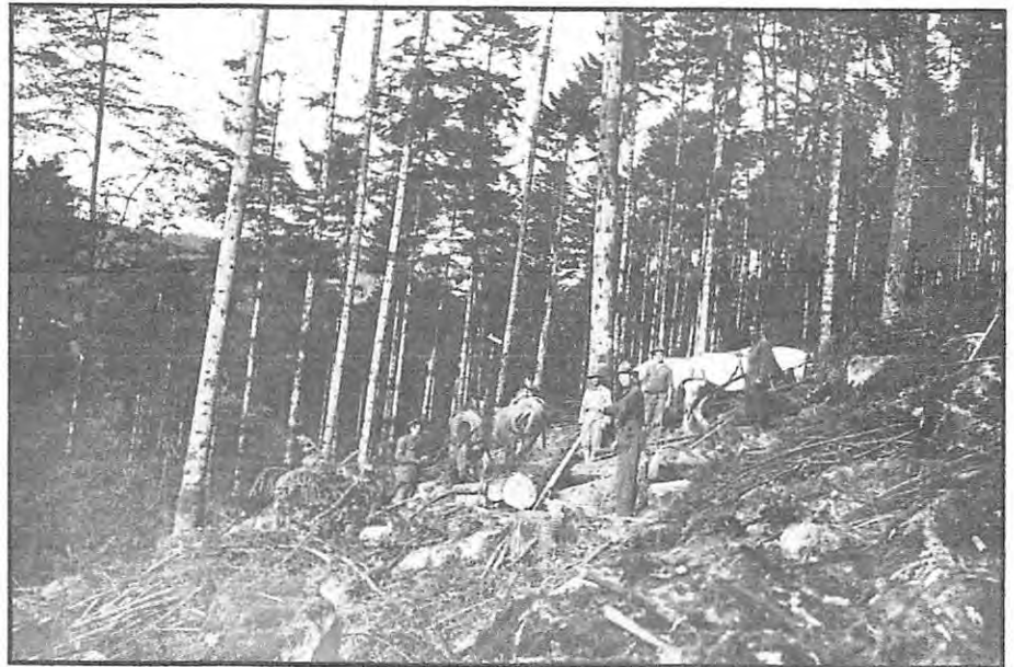
Men of the 43rd Company, 20th Engineers logging silver fir in the Vosges Mountains of eastern France

On arrival in France, the 42 nd Engineers were dispersed, with several companies going to the Maritime Provinces in Southwest France. Company B was initially stationed at Eclaron in eastern France. In mid-July, Company B was sent to Vagney in the