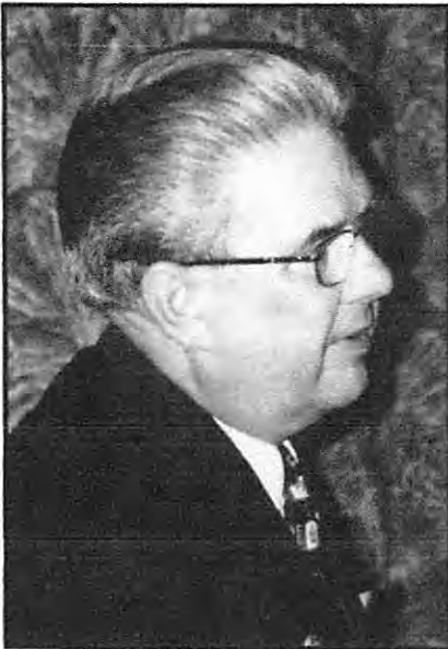
US Representative John Peterson

Congressman John Peterson was the featured speaker at the banquet and talked about the loss of appreciation for our rural values. He also discussed some of the wild ideas that the "fringe environmentalists" put on the table. His presence on the program, and frank question and answer discussion was appreciated by the Allegheny SAF membership.