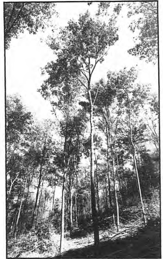
Crop trees after cleaning release

Cleanings resulted in almost double the net basal area growth compared to control plots. The cleanings increased diameter growth by 35-77% compared to controls. After 10 years, diameter growth of released trees exceeded that of controls by an average of 0.6, 1.0, 1.1 and 1.4 inches for chestnut oak, northern red oak, yellow-poplar and black cherry, respectively. The release +5 treatment increased diameter growth by 75-82% compared to controls. Cleanings reduced clear stem length for yellow-poplar and black cherry averaging 30 feet on control trees, 26 feet on released trees, and 20 feet on release +5 trees. Even though diameter growth rates were higher from reductions in competition, these results indicate that heavier release treatments are not recommended if maintenance of