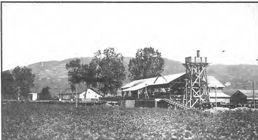
Sawmill at Vagney, Vosges built and operated by the 43rd Company, 20th Engineers