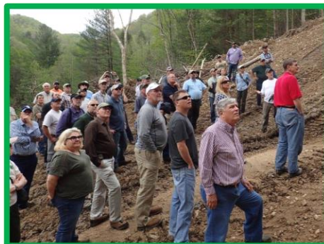
Attendees watch log jammer in action