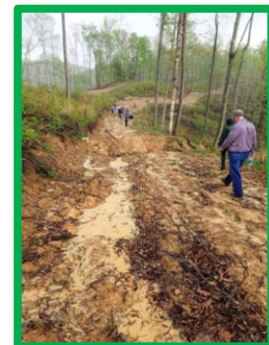
Functioning BMPs after a hail storm