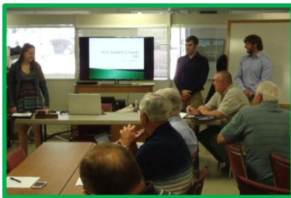
WVU Students shared the details of their research projects