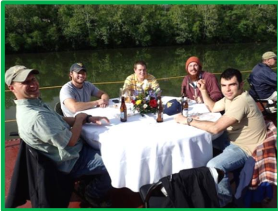
WVU Students were well represented at the meeting