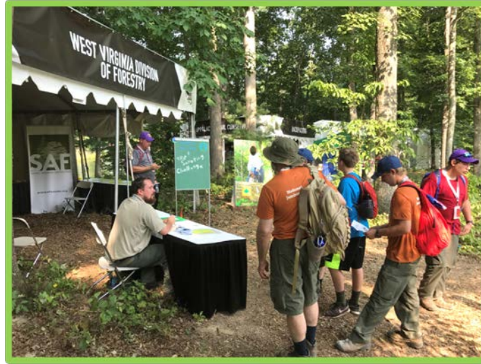
Boy Scouts visit the Conservation Trail at the National Jamboree.

Those who are Amazon.com shoppers are urged to donate a portion of their purchase price to the WVU Forestry Endowment Fund through the Amazon Smile Program. To do this, the shopper needs to sign into Amazon Smile when placing an order with Amazon. Once the order is placed, the shopper will have the opportunity to indicate the donation be made to the Forestry Endowment Fund.