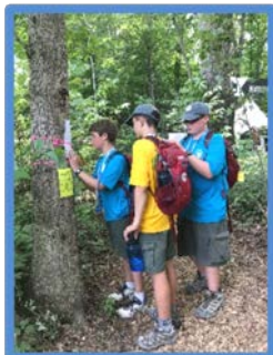
Scouts take the Forestry Challenge

As it had done in the lead on this partnered with to forestry answer We also Challenge. forestry