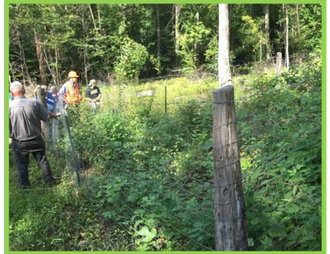
The group discusses the effects of deer herbivory and the rich biodiversity and productivity on the inside of the deer enclosure compared with that on the outside.