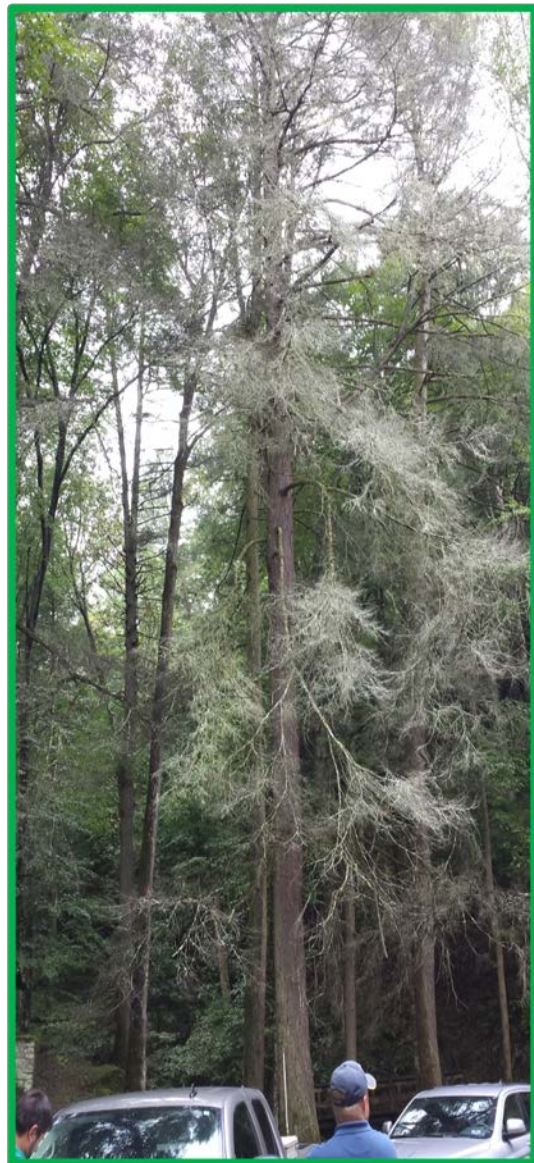
Hemlock Woolly Adelgid Mortality

THANKS TO ALL WHO MADE THE MEETING POSSIBLE!