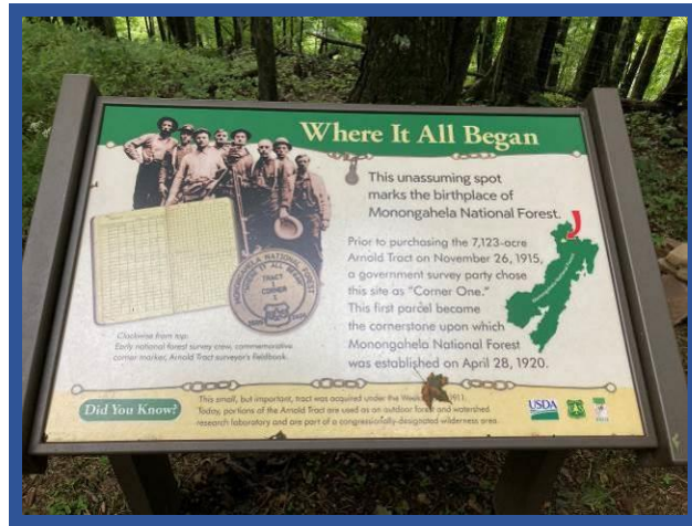
First corner for the Monongahela National Forest and interpretive signage