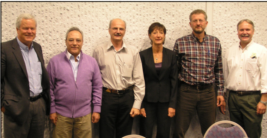
Speakers from the workshop sponsored by North American Forest Commission and SAF: "Adding Value to North American Forests" October 30, 2010, in Albuquerque, NM.

The rest of the convention was equally busy with over 200 presentations to choose from among the science and technical talks, and 100 posters to visit. The focus of the keynote presentations during the general sessions was on watershed issues: the important role forests play in protecting water sources and reducing treatment costs; difficulties in allocating water supplies, especially in the West where reservoirs are low; the need for increased conservation measures as population increases; and water supply challenges associated with climatic extremes. There were also workshops, tours, working group meetings and forestry school alumni receptions. However, the greatest benefit of attending SAF meetings and conventions is interacting with a wide diversity of students and professionals and sharing ideas and energy. 🌱